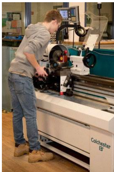
Student Certifications National Institute for Metalworking Skills (NIMS) Level I